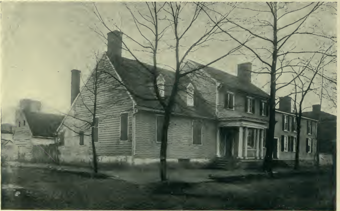
MARY WASHINGTON HOUSE, FREDERICKSBURG, VIRGINIA

There is a beautiful hall and stairway. All bedrooms have slanting ceilings. Washington slept at this place when he came to visit his mother